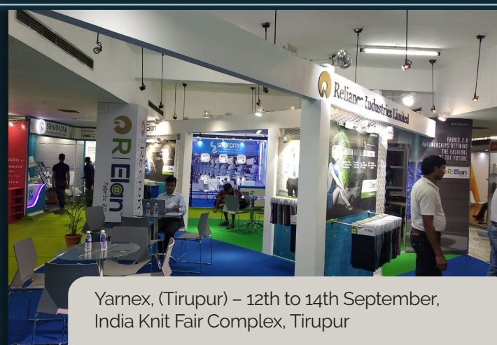
Yarnex, (Tirupur) – 12th to 14th September, India Knit Fair Complex, Tirupur