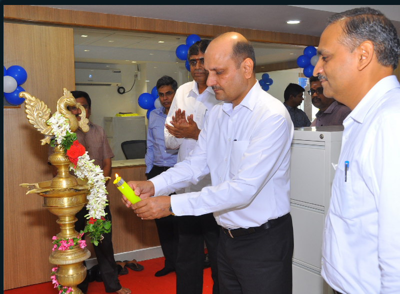
R|Elan™ Studio - Tirupur launch event

R|Elan, the next-gen fabric from RIL, has launched its latest studio in Tirupur. It's set to display its future ready innovative range of sustainable and performance fabrics. The studio will be a hi-tech experience centre that showcase all its Hub Excellence Partners' (HEP) state-of-the-art products and developments across the aesthetics, performance, and sustainability categories. Exciting times ahead!