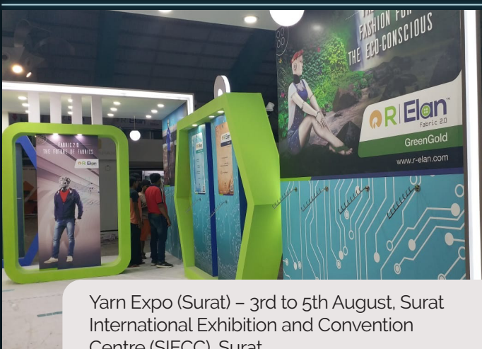
Yarn Expo (Surat) – 3rd to 5th August, Surat International Exhibition and Convention Centre (SIECC), Surat