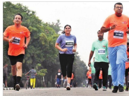
Participants during the 10km run organised by the Ludhiana Runners on the Punjab Agricultural University campus on Sunday.