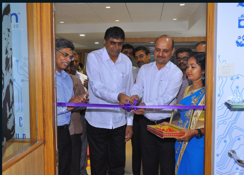
R|Elan™ Studio - Tirupur launch event