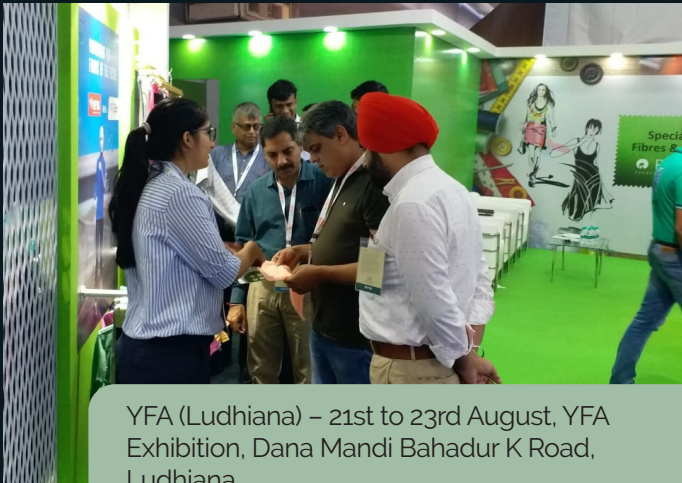
YFA (Ludhiana) – 21st to 23rd August, YFA Exhibition, Dana Mandi Bahadur K Road, Ludhiana