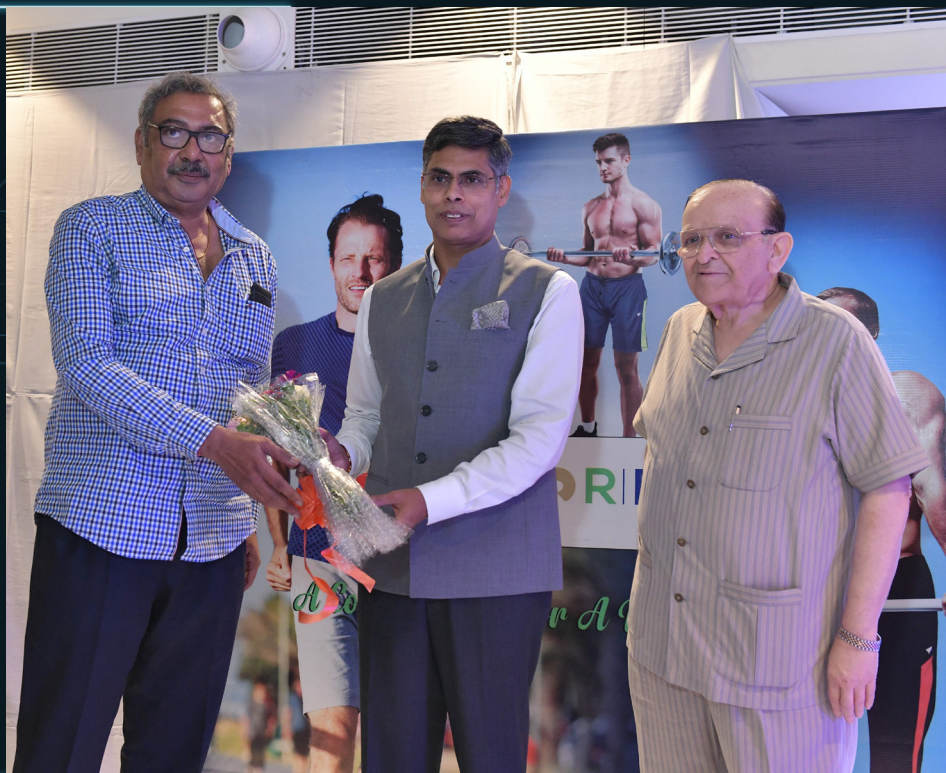
R|Elan™ & Neva meet

R|Elan joined forces with Neva Garments Ltd to showcase the SS'20 range of apparel at the Grand Imperia Banquet. The fashion show wowed around 350 retail partners. They admired the upcoming range for its high-performance and new-age functionalities.