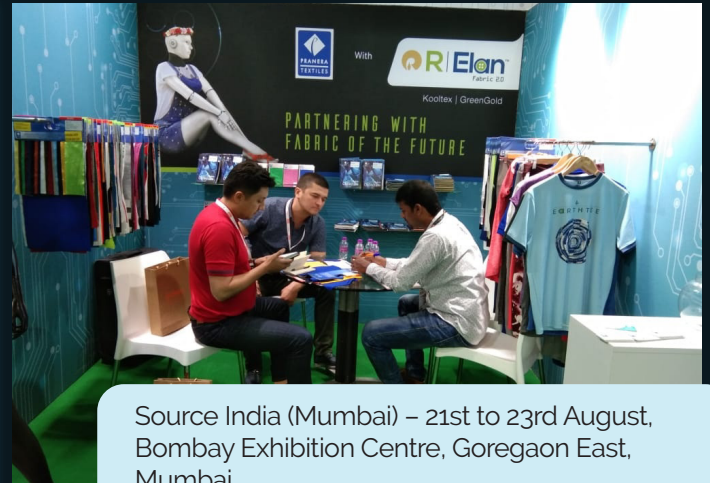
Source India (Mumbai) – 21st to 23rd August, Bombay Exhibition Centre, Goregaon East, Mumbai